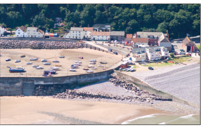
Looking on to the harbour and Quay Street, Minehead.