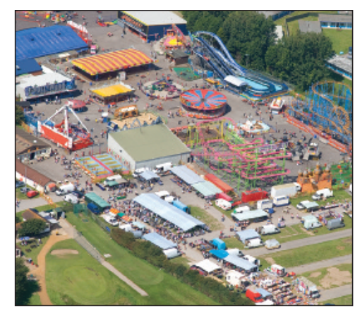
Brean's colourful fun fair.