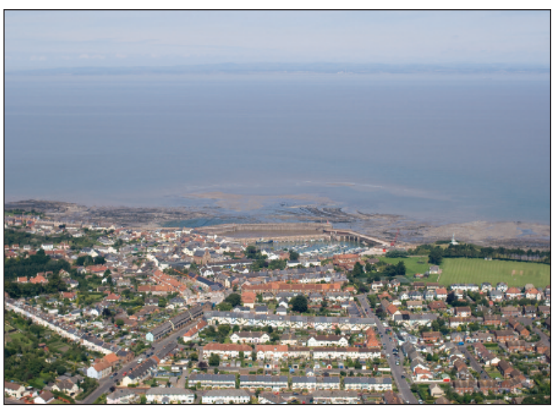
Looking out to sea over Watchet