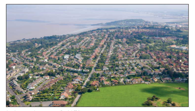
Looking north-east over Redcliff Bay.